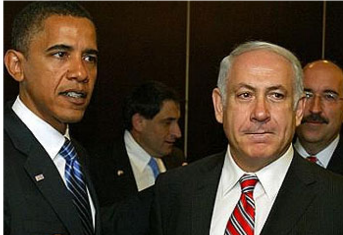
U.S. Pres. Obama vs. Israeli PM Netanyahu

Mr. Obama next began calling for something no previous administration has insisted on. He demanded that Israel completely halt all "settlement" activity in the West Bank and in East Jerusalem.