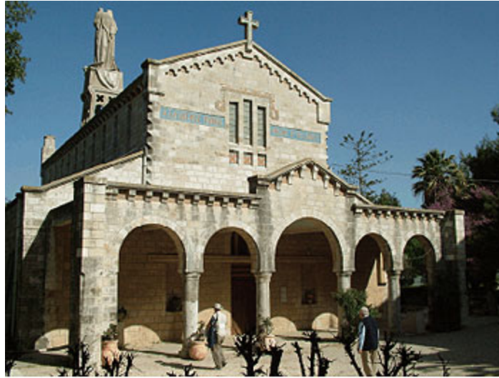
The Church of the Ark of the Covenant in modern day Abu Gosh, the biblical town of Kiriath-jearim.

When David arrived in Jerusalem, the first priority of his administration was to provide the Ark a proper resting place because He was anxious to bring the symbol of the presence of God back into the life of the nation ( Psalm 132: 1-5 ). The Ark's return was an occasion for great rejoicing ( 1 Chronicles 15:25-29 ). David placed it in a tent on Mount Moriah (today's Temple Mount) where it remained until his son Solomon built the Temple. The Holy of Holies in that Temple became the final resting place of the Ark (1 Kings 8 and 2 Chronicles 5).