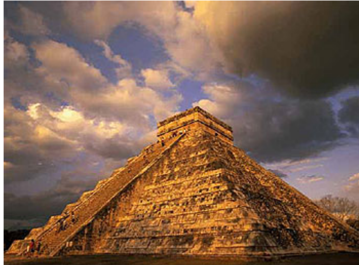
The Mayan stepped pyramid at Chichen Itza

The Mayans built incredible structures. Everything about their whole civilization was built in relation to the universe, pointing to something important in relation to the stars and their alignments. It is really incredible to read about them.